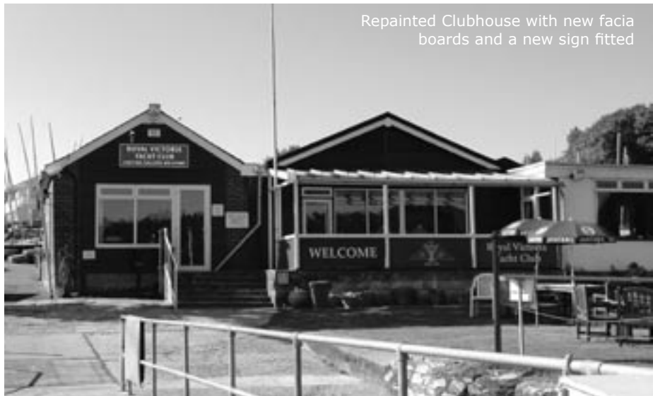
Repainted Clubhouse with new fascia boards and a new sign fitted

Repairs have been carried out to the numerous pot holes in the drive; the speed humps marked and the disabled parking bay clearly marked. We will continue to paint/ repair the exterior of the building during the summer, but sailing will come first.