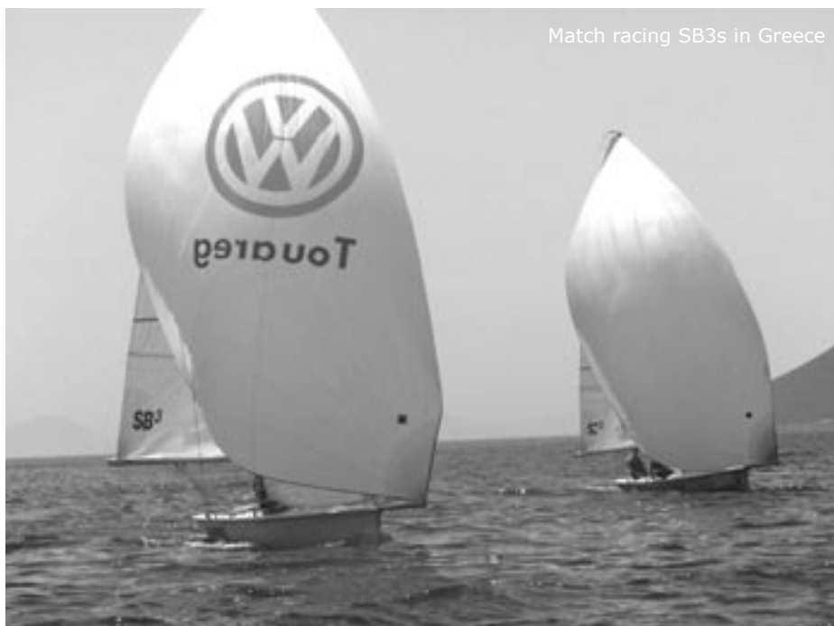
Match racing SB3s in Greece